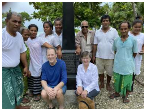
The site where Hiram Bingham first landed when he brought the gospel to Abaiang and Kiribati in 1857.