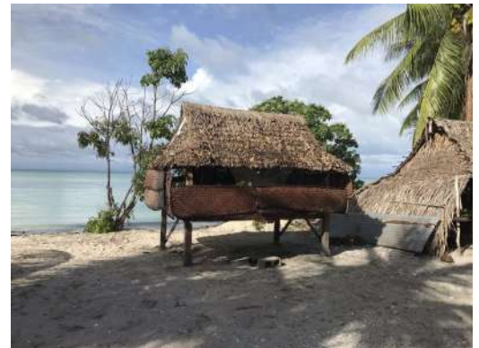
The small kiakia was their home for four days in the village of Ewenna on the island of Abaiang (Republic of Kiribati).