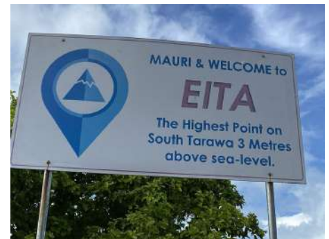
These pictures depict why Kiribati faces such an existential threat from sea level rise due to climate change. Very low lying islands. Many houses are hugging the shore.