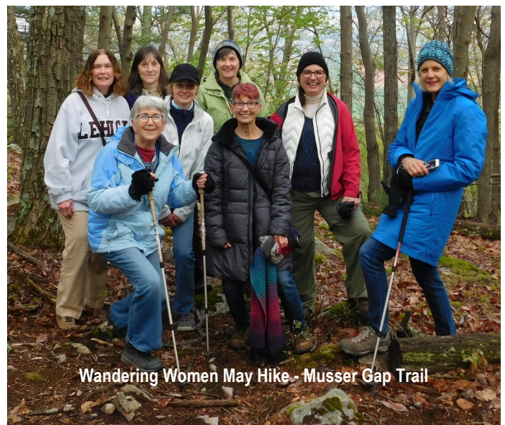
Wandering Women May Hike - Musser Gap Trail

If you'd rather not lead a hike, you can just come and enjoy. Generally, hikes will be 2-3 hours (9:00 am start). So that all can participate, hikes will be easy to moderate (not difficult or too rocky). We're planning some special edition hikes as well, e.g. 10,000 Steps. Join us for fun, fellowship, and fitness!