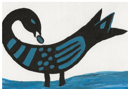
The symbol selected by the Co-Moderators of the 224th General Assembly (2020) is the Sankofa bird standing in the Mississippi River.