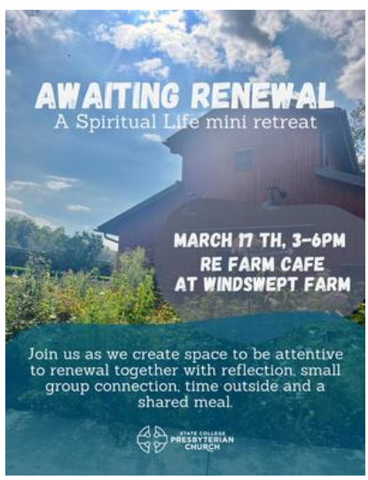
Register on our website—scpresby.org

Connect will also be meeting in Rm 10 at 10:15 am. Connect is an invitation to deepen your relationship with others and with God by contemplating scripture, lyrics, writing, poetry, and other topics of interest through small group discussions.